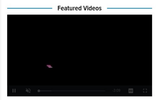
Spoilers of the Week Jan.31st -Feb.4th